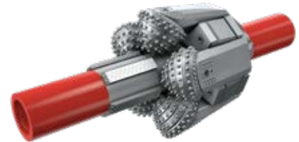
24" XTR-W TCI

Inrock's patented XTR-W reaming platform, provides a high-quality alternative to traditional "split bit" reamers. The streamlined and robust XTR-W design leverages Inrock's proven cutter segment technology to deliver a cost-effective and high-performance reaming tool. XTR-W reamers can be built on a range of connection types and utilize MT, TCI, Hard Rock TCI or Premium TCI cutter segments. XTR-W reamers can be used on both small and large rigs and come in sizes ranging from 12-3/4" up to 48".