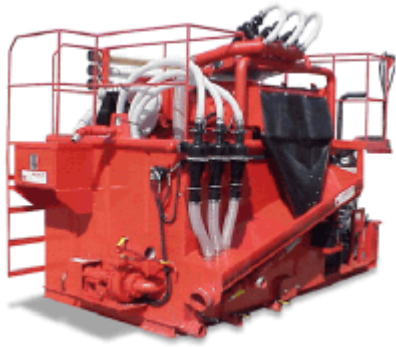
Recovery and Cleaning Equipment