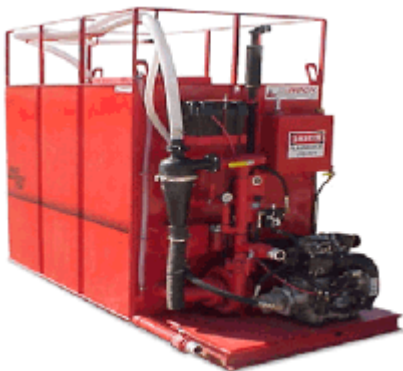
Mud Mixing Equipment