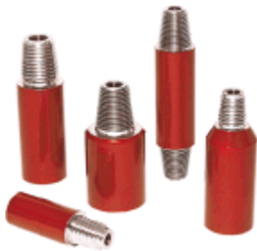
End Load Sonde Housing (No bolts to come unscrewed)